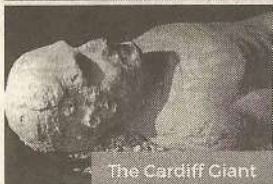
The Cardiff Giant