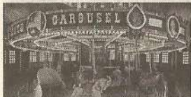
The Empire State Carousel