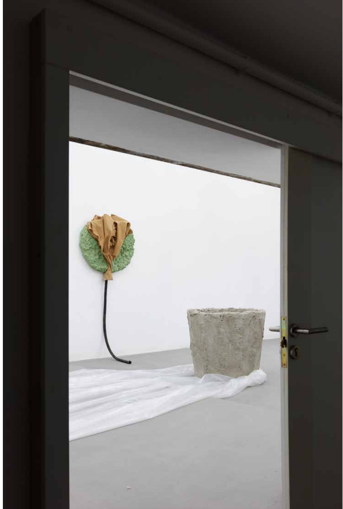
STORAGE ROOM of ARTKARTELL Project Space