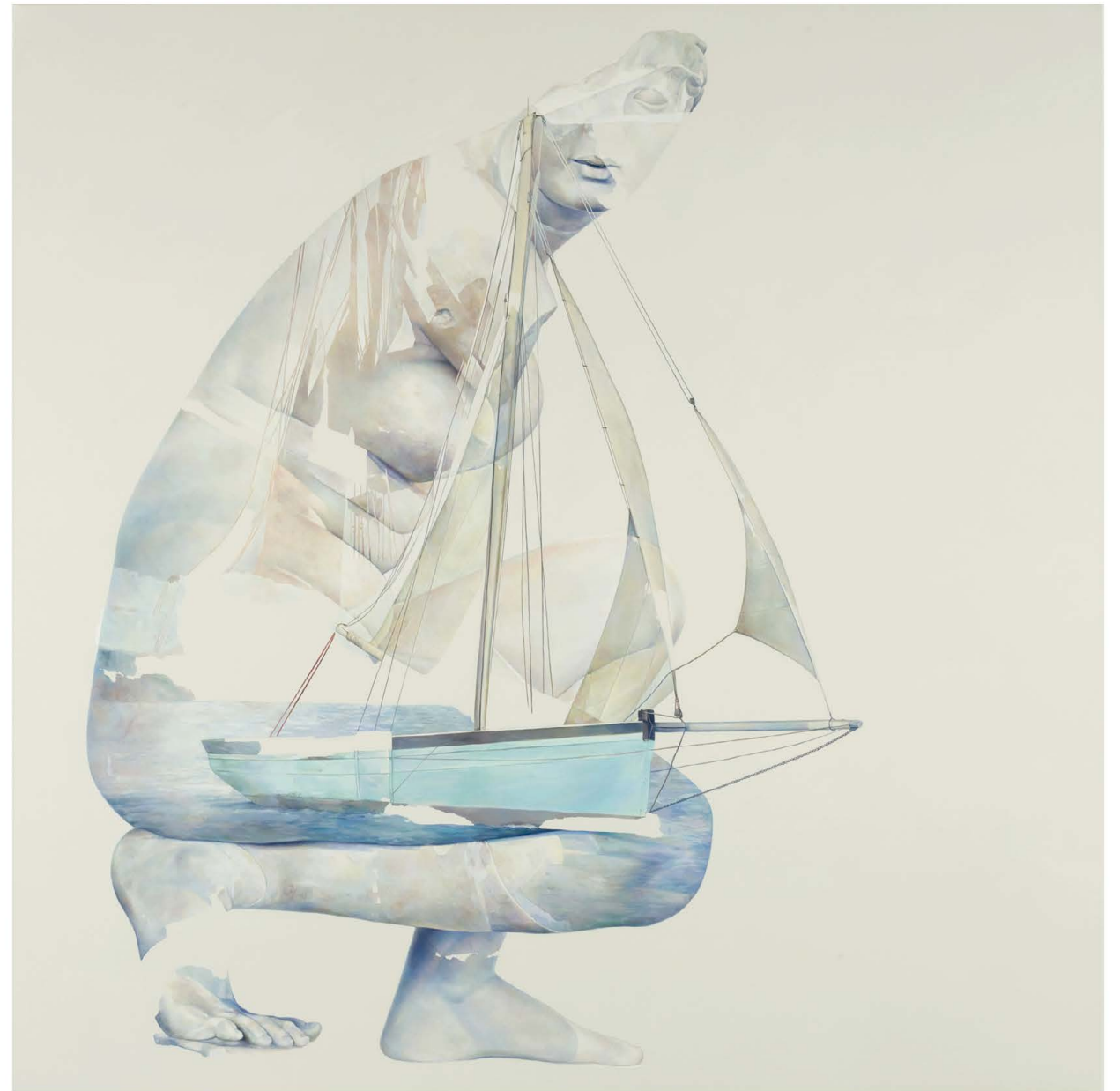
L'EAU | oil on canvas | 115cm x 115xm | 2014