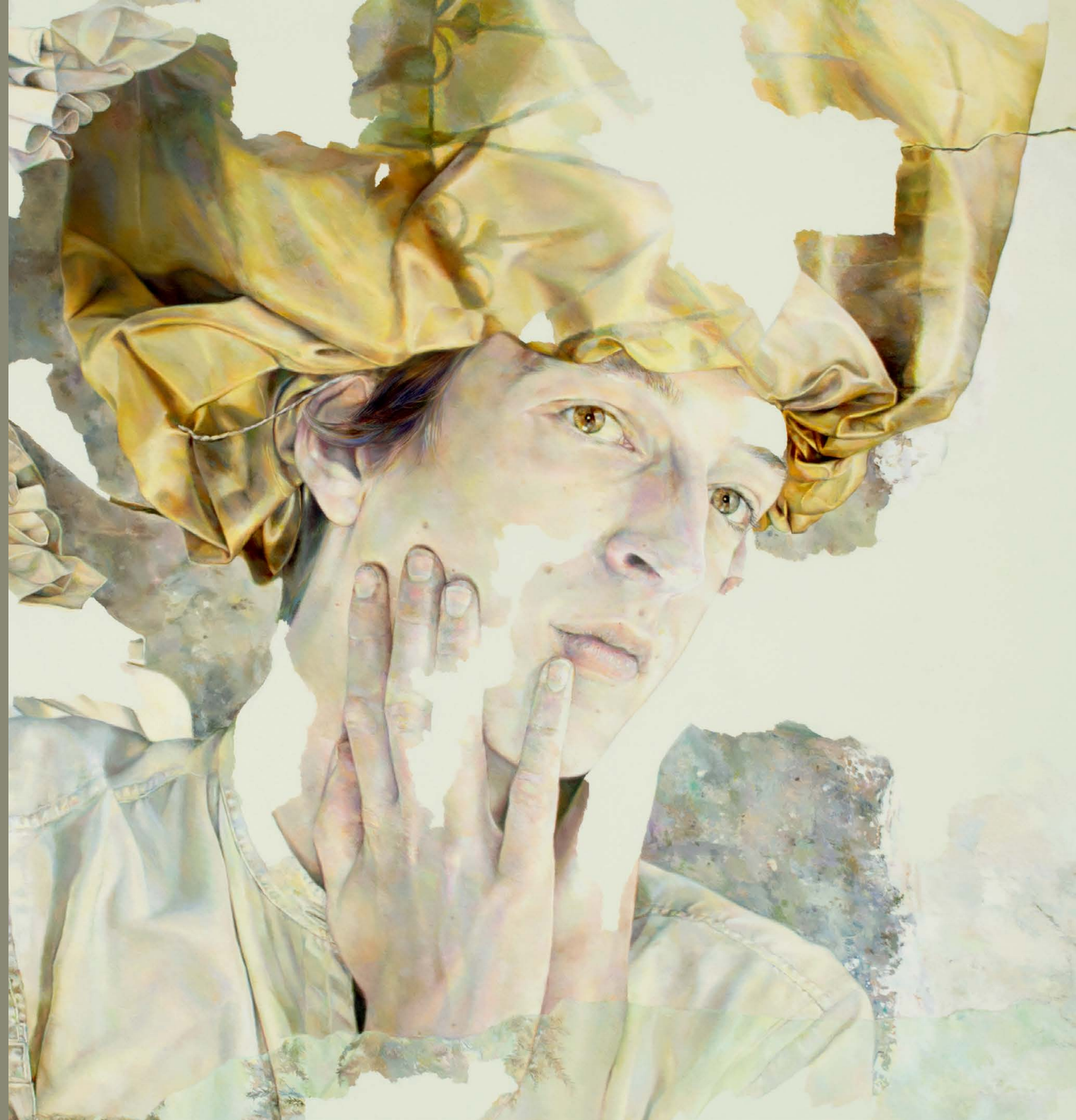
OBLIVION, THE AFFINITY FOR SIMPLICITY | detail | 2013