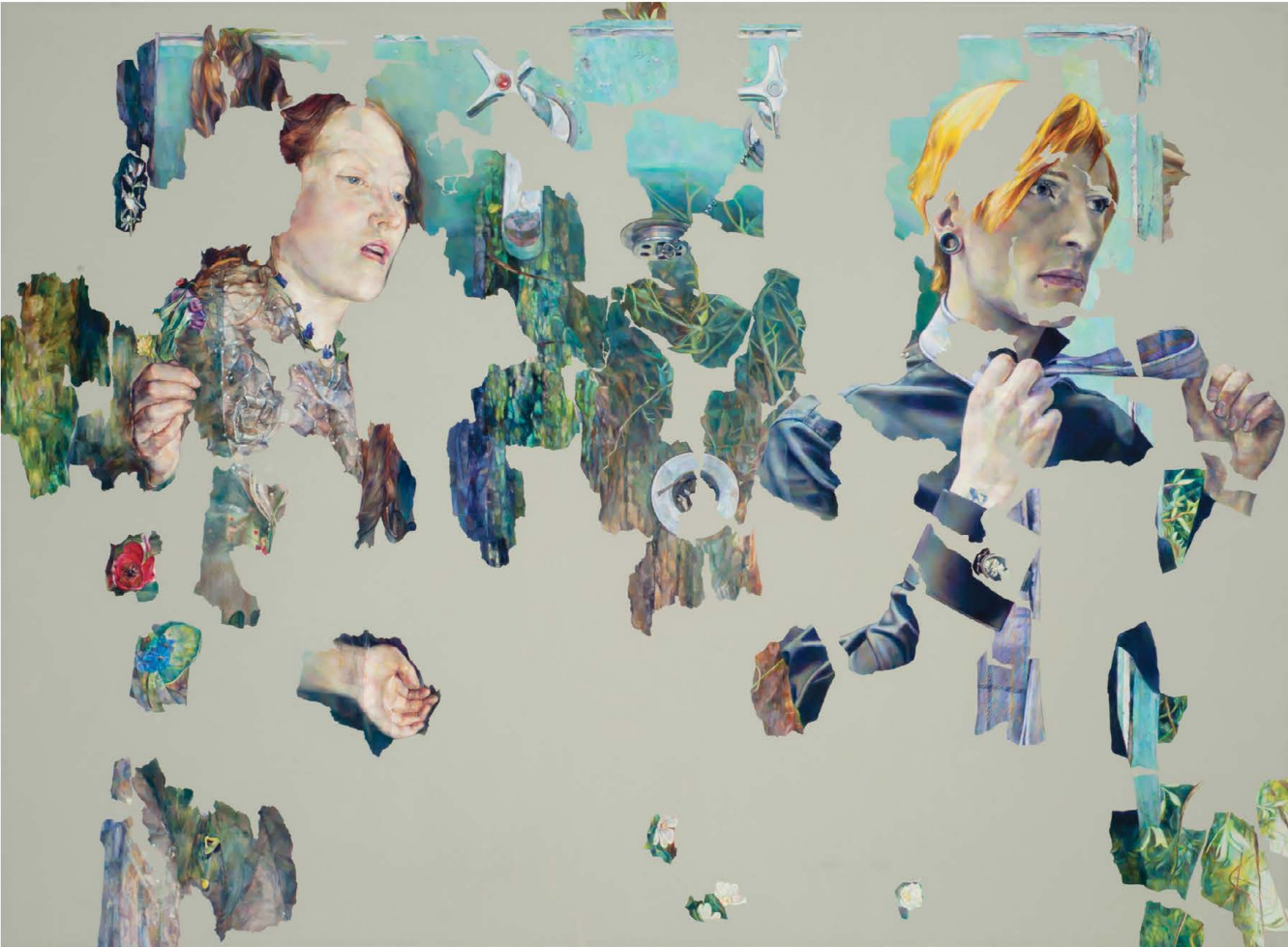
REMEDY | oil on canvas | 70cm x 95cm | 2010