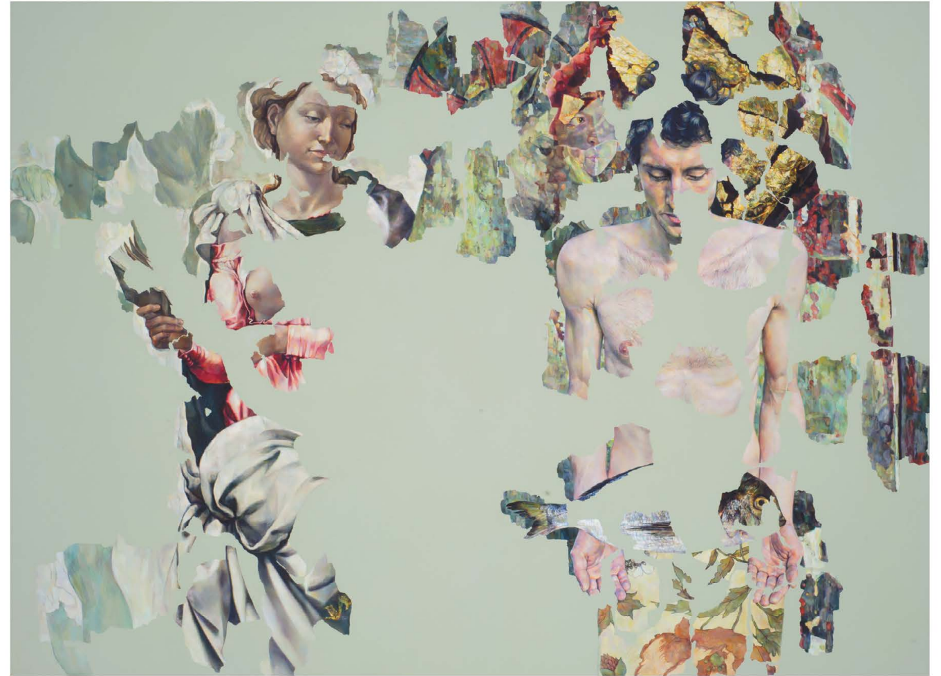
THE UNSPEAKABLE | oil on canvas | 70cm x 95cm | 2010