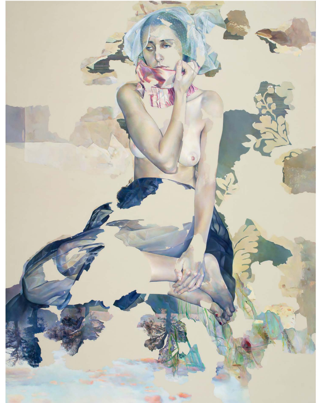
THE IDEOLOGY OF INNOCENCE | oil on canvas | 130cm x 100cm | 2015