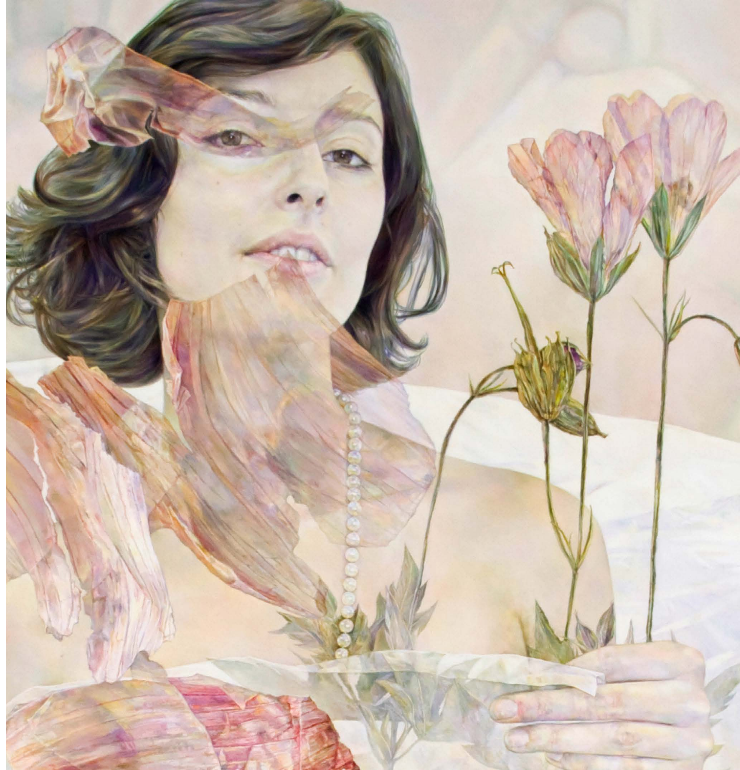
IF I DO NOT HAVE LOVE, I AM NOTHING | detail | 2013