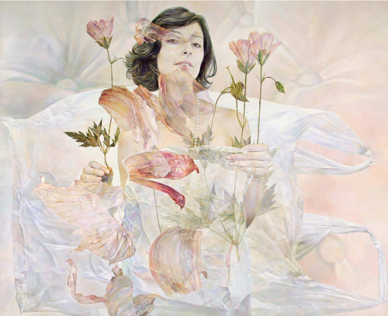
IF I DO NOT HAVE LOVE, I AM NOTHING | oil on canvas | 90cm x 110cm | 2013