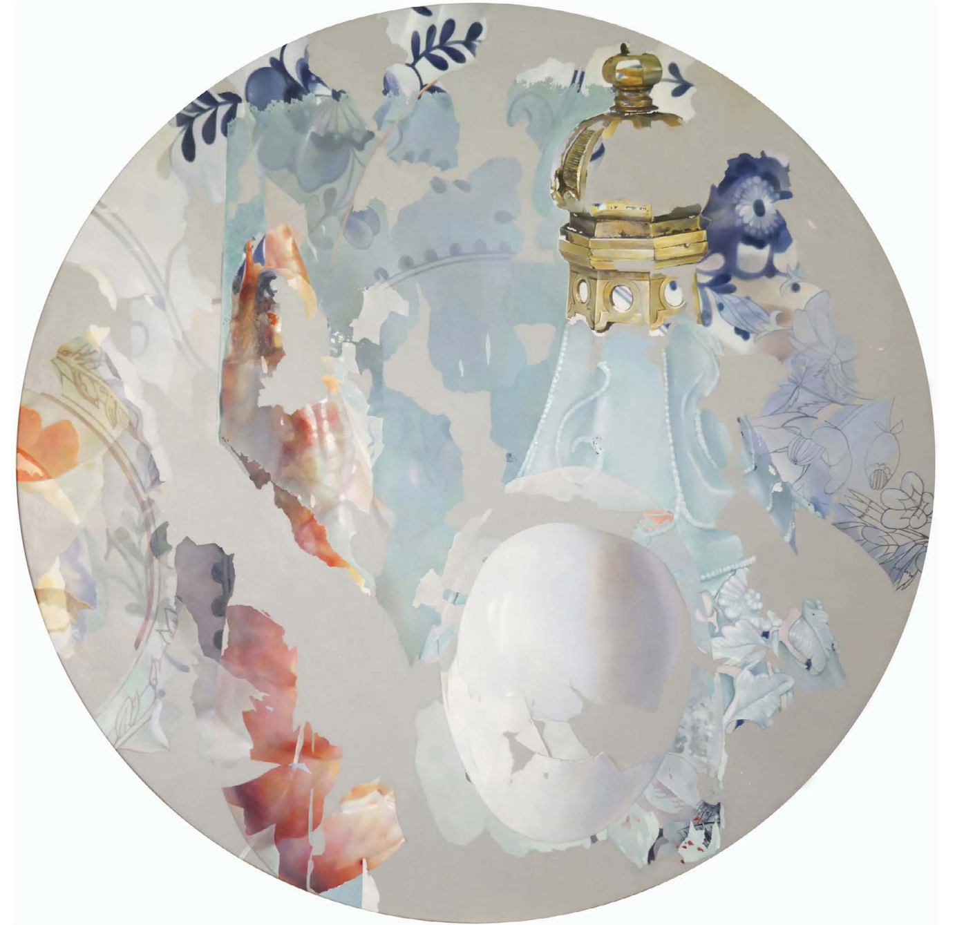
DEBUSSY | oil on canvas | 80cm x 80cm | 2014