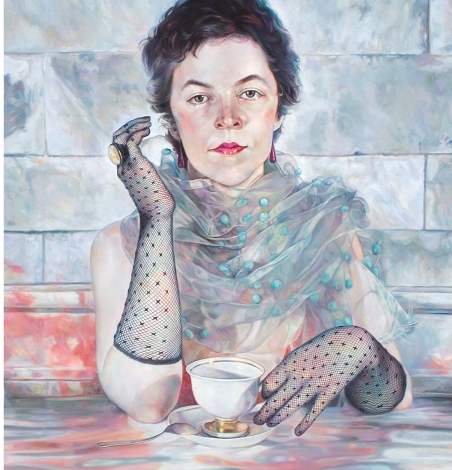
TEA AT BUCKINGHAM | detail | 2007