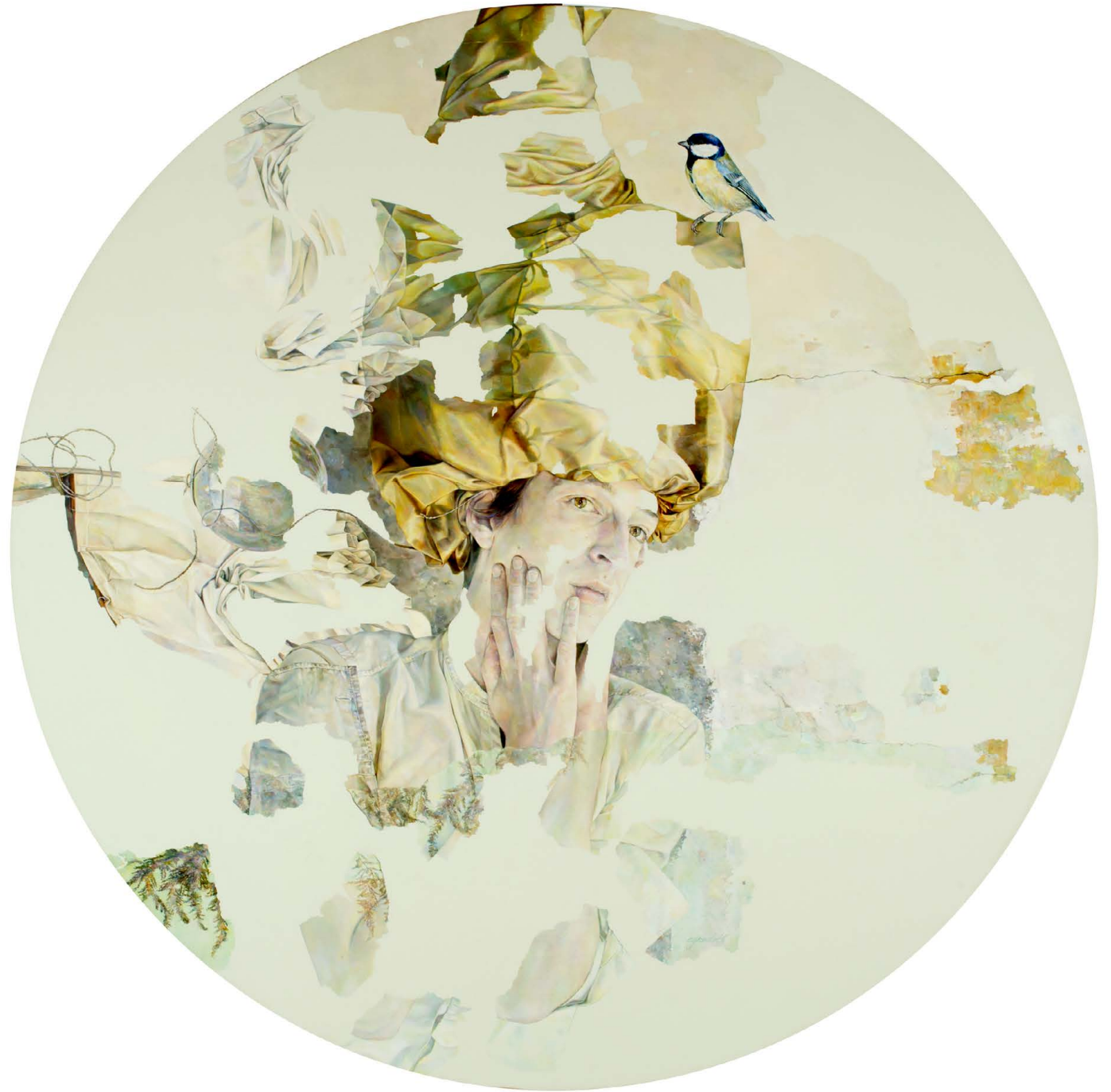
OBLIVION, THE AFFINITY FOR SIMPLICITY | oil on canvas | 110cm x 110cm | 2013