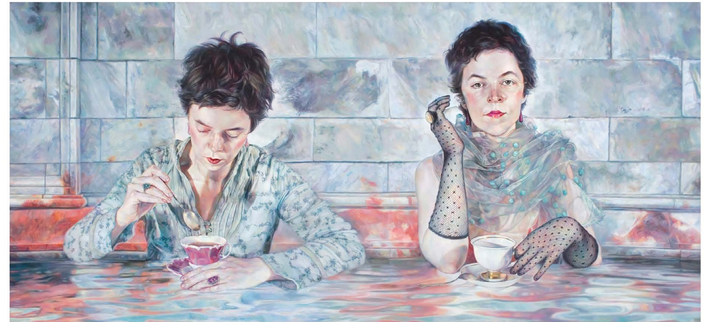
TEA AT BUCKINGHAM | oil on canvas | 74cm x 160cm | 2007