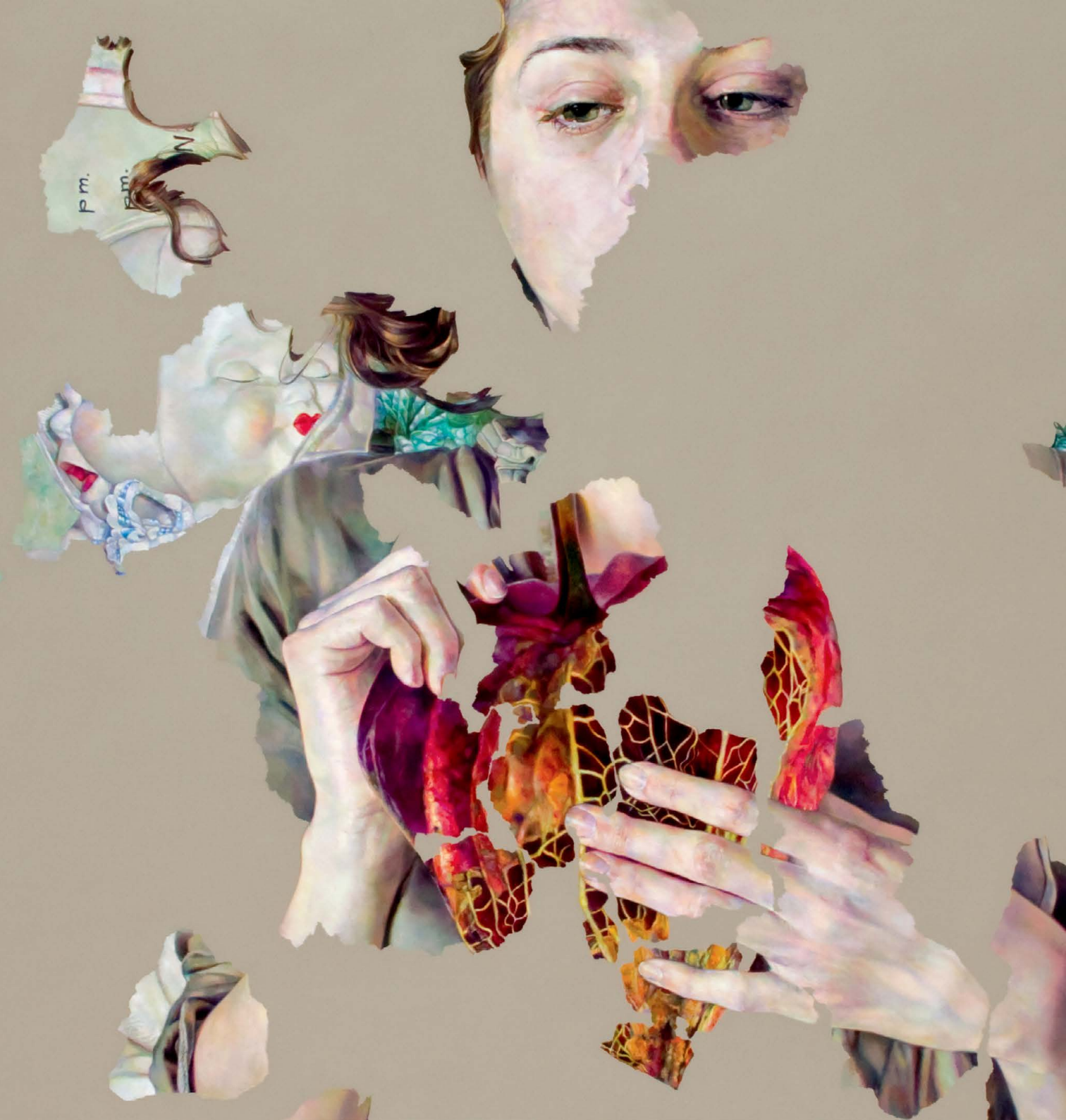
EMPATHY | detail | 2010