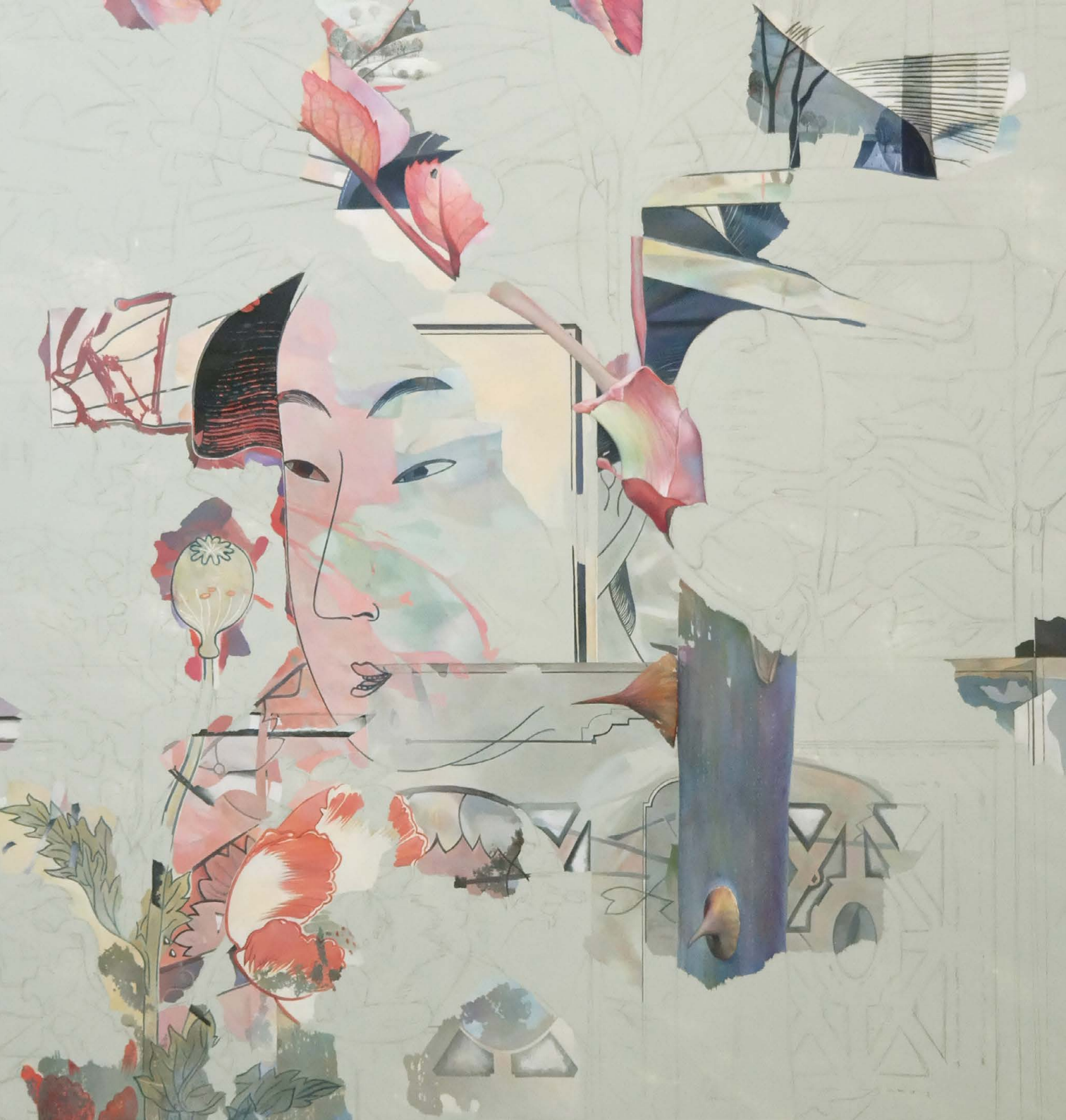
GOOD NATURE | detail | oil on canvas | 2016