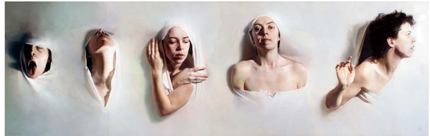
THE FIVE SENSES | oil on canvas | 100cm x 313cm | 2005