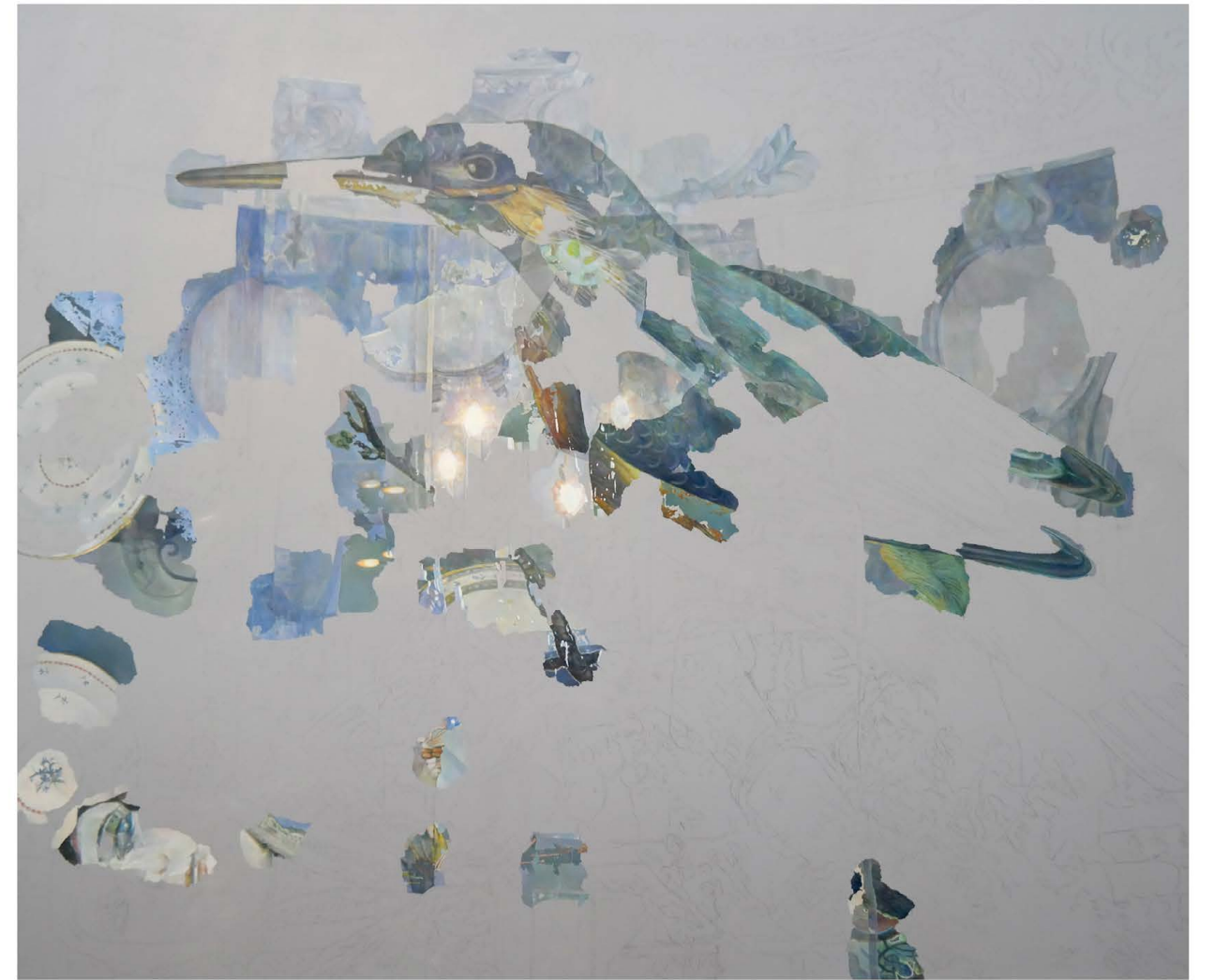
PARIS | oil on canvas | 150cm x 120cm | incomplete | 2016